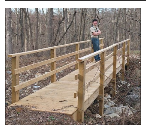
Jacob Cornwell stands on the bridge constructed for his Eagle Scout project.

Well maintained and litter free properties increase individual neighborhood and community property values as well as quality of life. Let's all do our part!