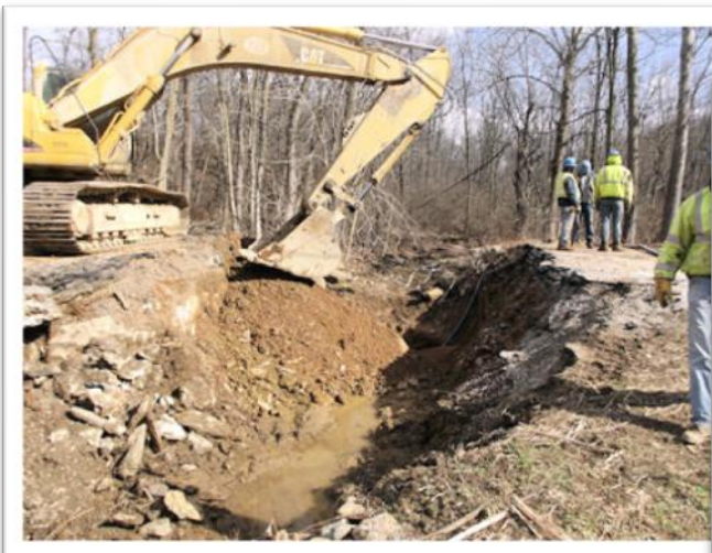
Preparing Country Club Road for box culvert installation