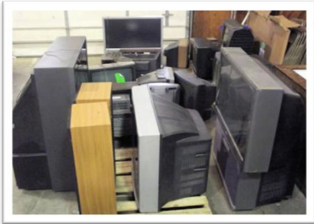
Electronics and TVs ready for delivery to York County Solid Waste Authority

During the first six (6) weeks of electronics recycling, the Township had 212 visitors who filled 27 skids with a variety of electronics and televisions. As you may recall, a new state law has taken effect that prohibits waste haulers from collecting electronic waste at curbside, which is known as "The Covered Devices Recycling ACT." The Township continues to make electronics recycling available weekdays at