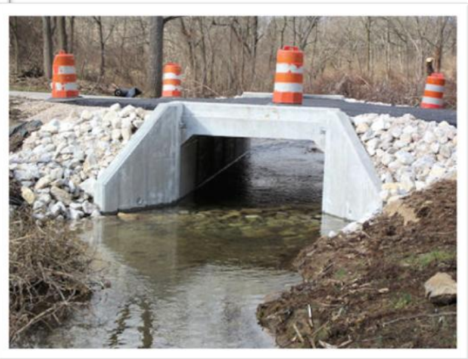
New box culvert on Daugherty Road